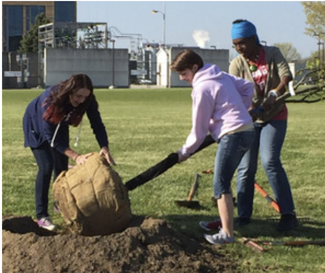
Arbor Day tree planing